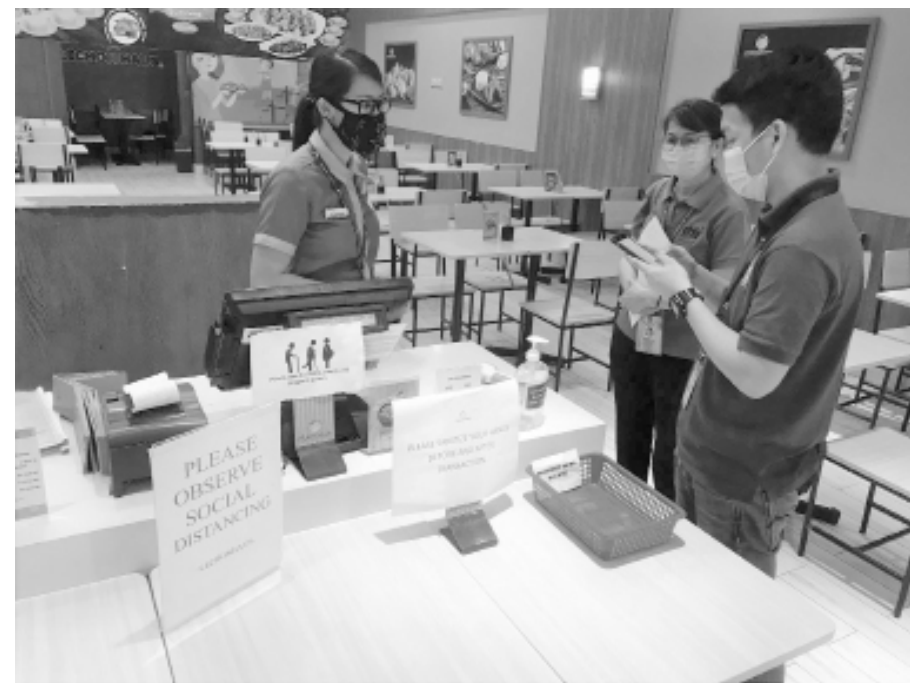
The monitoring team has set the next schedule City Bacoor. — (PTCAO) alone establishments. DTI on June 26, 2020 at SM

The monitoring team targets to visit all malls in Cavite and other stand-alone establishments.